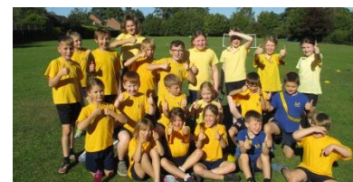
The Victorious Vikings!

4 th place: Romans 47 points 3 rd place: Danes 66 points 2 nd place: Saxons 72 points 1 st place: Vikings 96 points