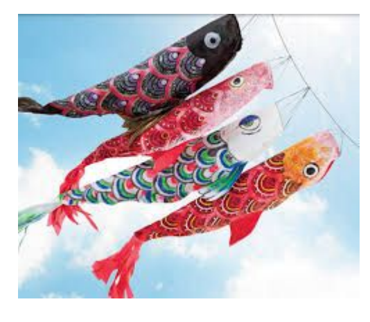
Kionobori Windsock -