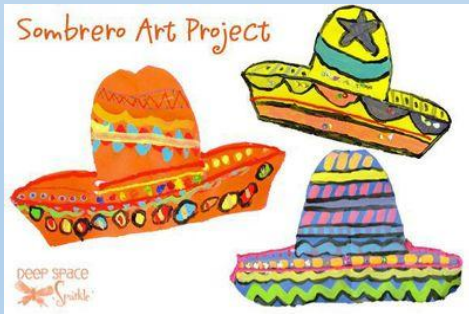
Design a sombrero!

Worry dolls- Muñeca Quitapenas are dolls that remove worries. Worry dolls help ease the child's worries or can be used to make wishes. The doll is told the worry, then placed under the child's pillow. The doll does the worrying while the child sleeps.