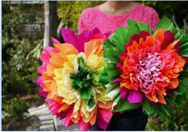
Tissue paper flowers for a fiesta!