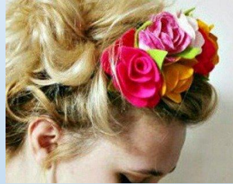
A flower garland like Frida Kahlo's!