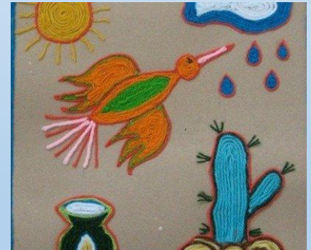
Making Cinco de Mayo Huichol yarn pictures