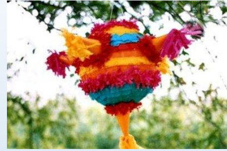
Make a pinata!