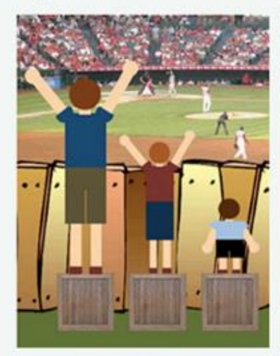
In the first image, it is assumed that everyone will benefit from the same supports. They are being treated equally.